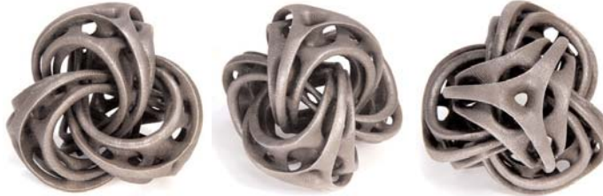
3 views of the piece Nexus , metal print, 3 1/4" diameter